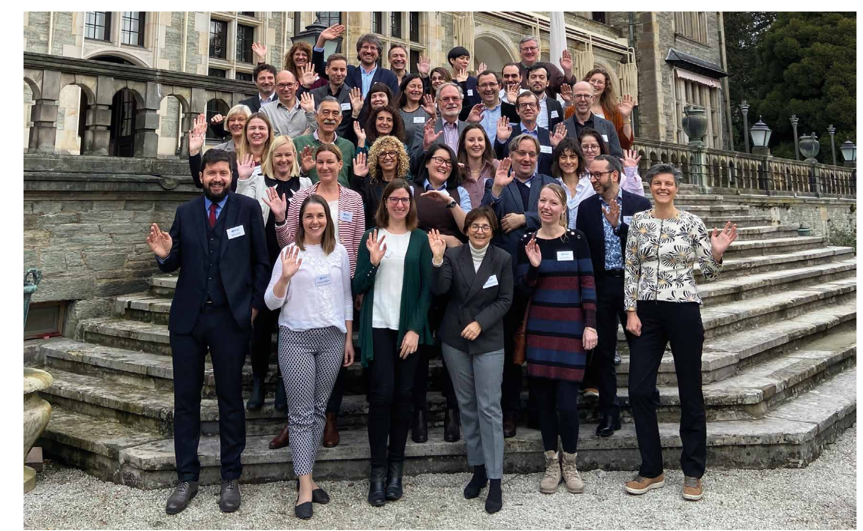
The PRIME consortium at the General Assembly Meeting in Frankfurt, 2020

THE GOAL PRIME starts from the hypothesis that comorbidity of mental and somatic illnesses is a result of dysregulated central and peripheral insulin signalling. The project will aim to investigate the molecular mechanisms underlying the mental and somatic, insulin-related multimorbidities and to outline new directions for research and clinical care.